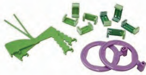
Uni-Verse-All Positioning Kit