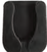
Wall Mount Holder